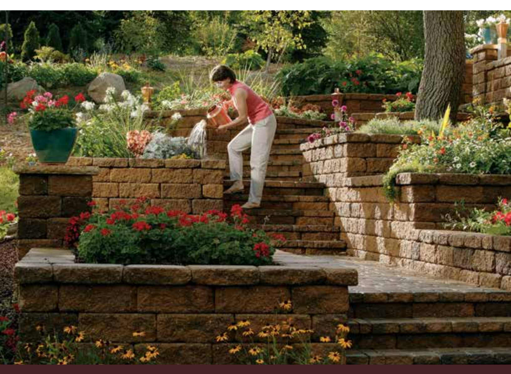
THE ORIGINAL solid, pinned retaining wall systems