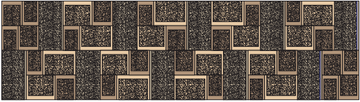
Small Unit Medium Unit Vertical Unit