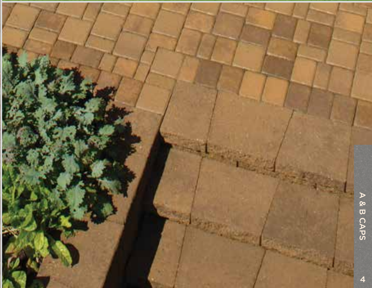
A & B CAPS