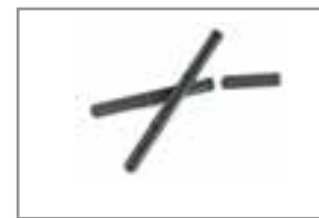
VERSA TUFF PINS