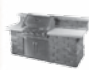
BAR & GRILLS